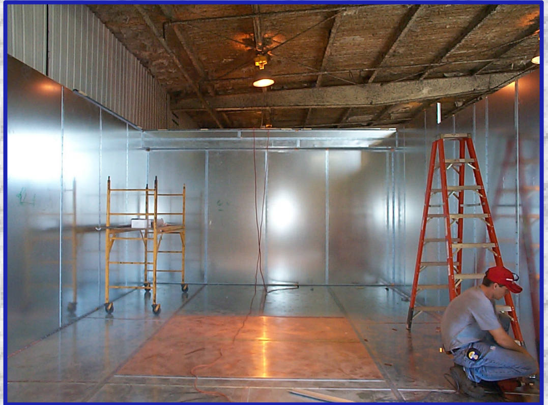
RF Floor and Wall System

Braden's Solid Core Modular "SCM" Radio Frequency shielded panel enclosure system offers durability, flexibility and exceptional performance.