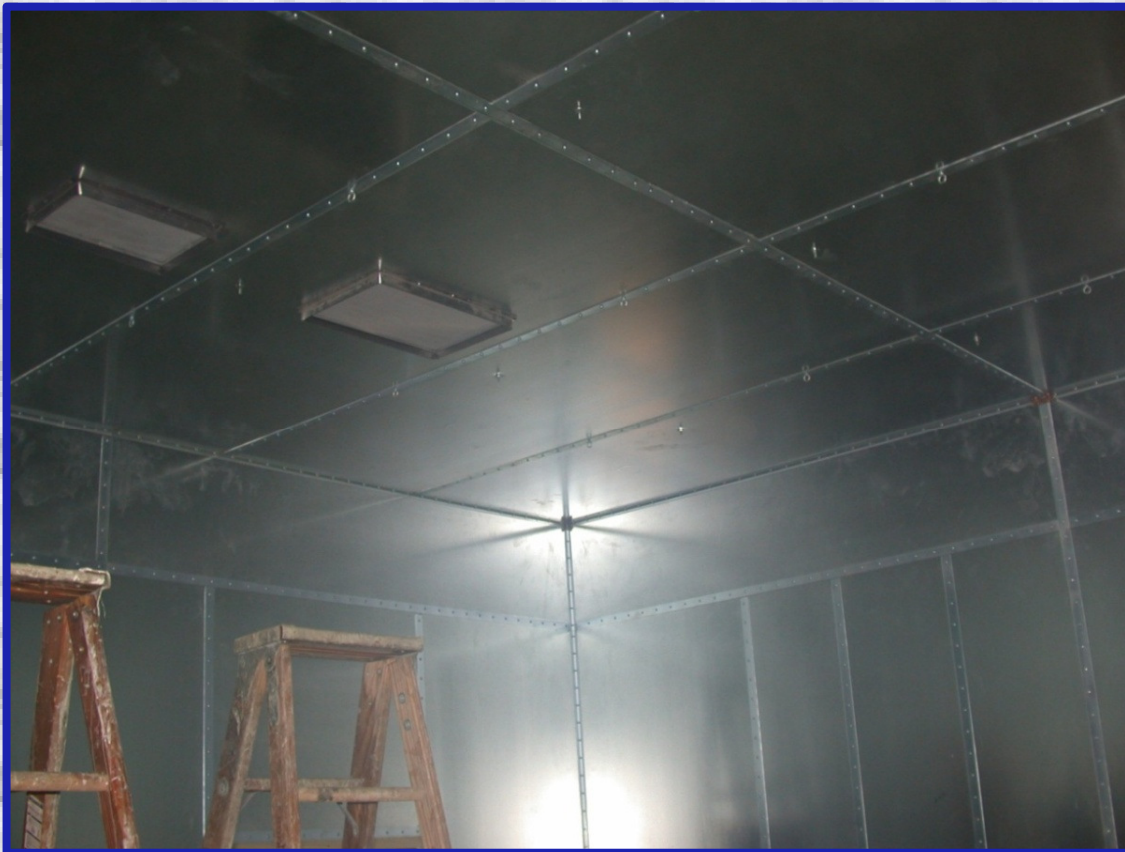
RF Wall and Ceiling System

Braden's SCM panel system is constructed of solid core with two sheets of shielding attenuation media.